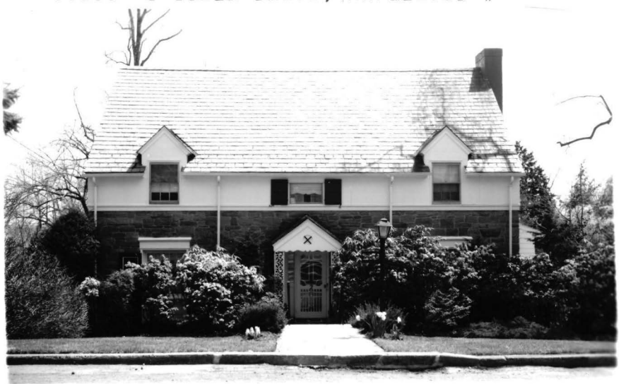
36550 2 TOWER DRIVE, MAPLEWOOD #

Board of Realtors of the Oranges and Maplewood